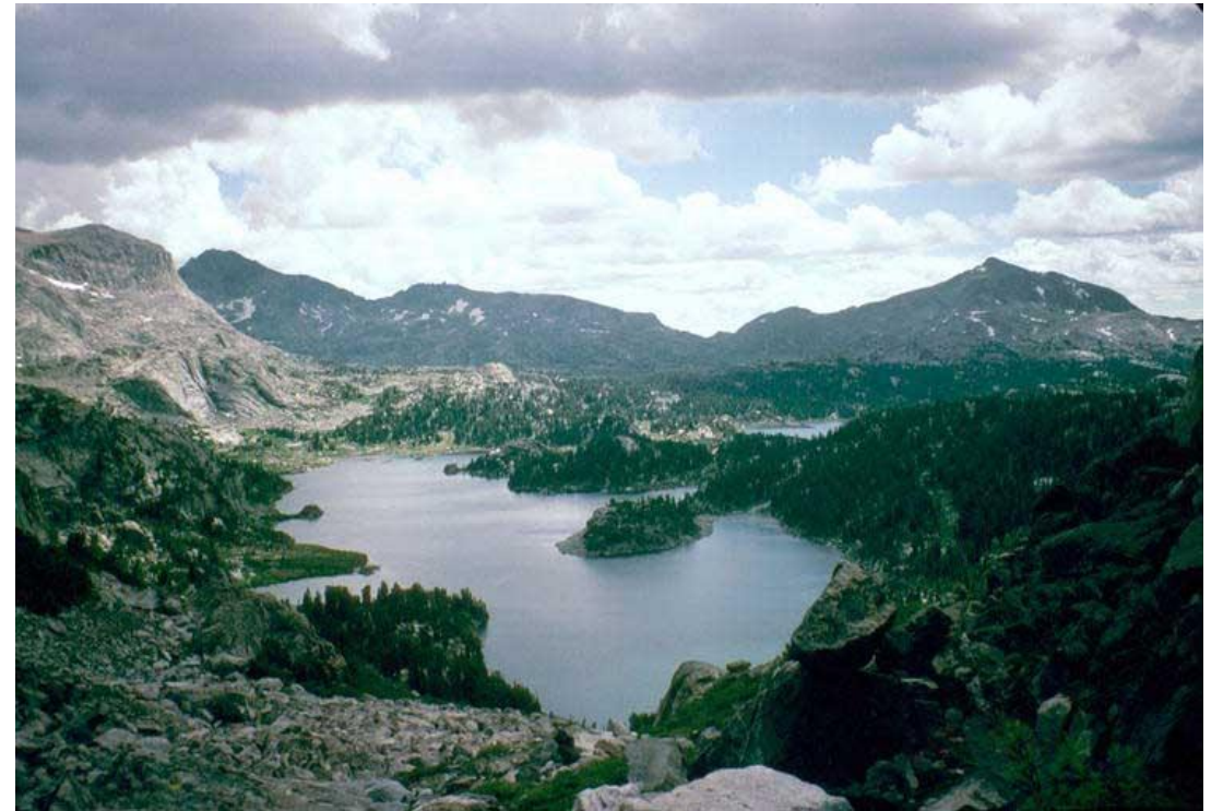
Cook Lake in the Bridger Wilderness, Bridger-Teton National Forest, Wyoming, U.S.